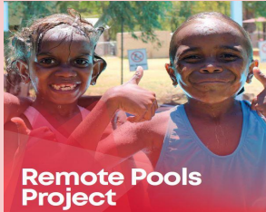
Remote Pools Project